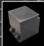
Spring-loaded induction blocks work with both EPPM and ECB systems to hold warped stock.